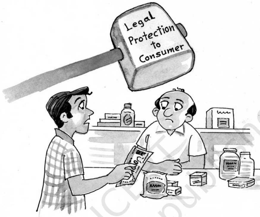
Protection against malpractices and exploitation

through electronic means or by teleshopping or direct selling or multilevel marketing. However, any person who obtains goods or avails services for resale or commercial purpose is not treated as a consumer and is outside the scope of Consumer Protection Act 2019.