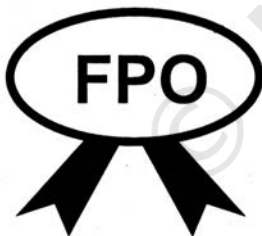
Food Process Order

India (FICCI) and Confederation of Indian Industries (CII) have laid down their code of conduct which lay down for their members the guidelines in their dealings with the customers.