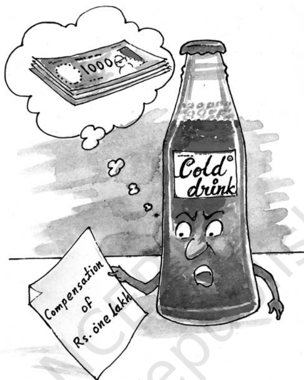
Compensation for impurities in cold drinks